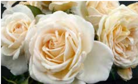
BRF Centenary Rose

Find your own special place, your own particular visuals, your own personal style, your own bespoke way of praying to God. Prayer should be as unique and as individual as you yourself are.