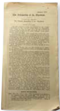
The first BRF Bible reading notes, January 1922

We can become so focused on how we are serving God that sometimes we do not pay attention to our spiritual health and fail to realise when our spiritual batteries run low... only when we spend time with God, can we remain fully charged and have enough energy to complete