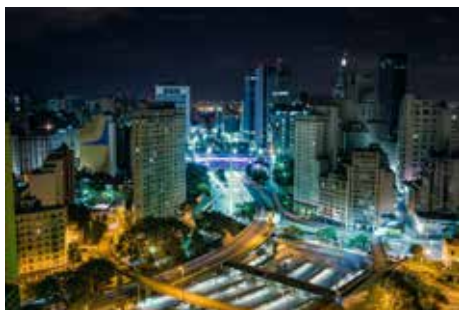
São Paulo, Brazil

Our belief in God may falter, but God never stops believing in us. In the same way Jesus is always praying for us, even when we stop praying.