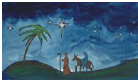
Illustration from Celebrating Christmas (BRF, 2021)

God of the everyday, we know that you come to us disguised in our lives. Help us to take time daily to look out for you in the apparent ordinariness of our existence.