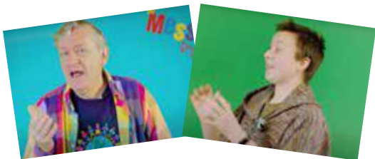
Video shots from Messtival

When you can't settle to pray and the words won't come; when God seems silent or remote – know that your experience is not unique but that the Spirit is praying within you with groans too deep for words.