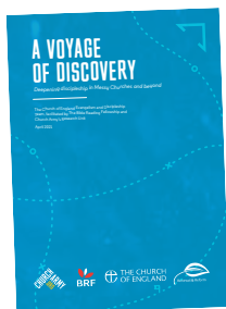
Research report on the Deepening Discipleship project